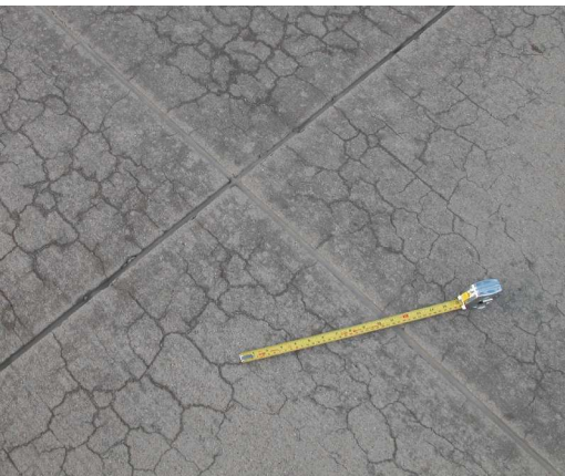
Photograph of map cracking on concrete pavement affected by alkali-silica reaction.

Determining the chemical composition of the gel may help investigators understand whether the ASR is at an early or late stage. 3 Other laboratory tests can help determine the likelihood that ASR will cause continued expansion. For example, residual expansion tests can be used to monitor cores for length change